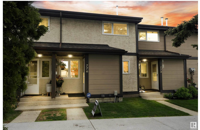
776 Clareview Rd NW, Edmonton, AB

1st Floor Exterior Area 290.37 sq ft Interior Area 533.41 sq ft