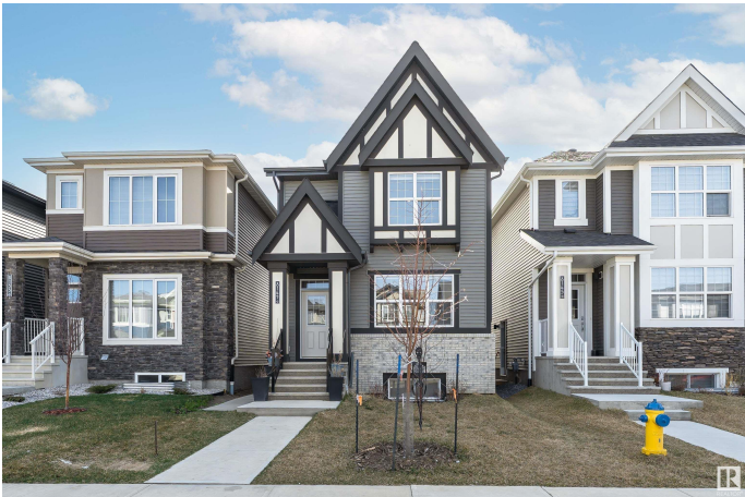
8149 226A St NW, Edmonton, AB

This two-story home offers 5 bedrooms, 4 bathrooms, a fully finished basement with a legal suite, and a detached double garage. The main floor includes a kitchen, living room, dining room, one bedroom, and a full bathroom. Upstairs, you'll find three spacious bedrooms and a shared bath, with the primary bedroom featuring a walk-in closet and ensuite. The basement legal suite has a separate entrance, providing added convenience. Located close to schools, shopping, and amenities, with quick access to the Henday.