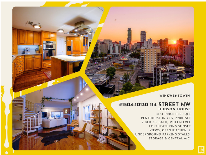
#1504 10130 114 STREET HUDSON HOUSE OLIVER, EDMONTON